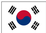
កូរ៉េខាងត្បូង (South Korea)

However, grower numbers have been squeezed by drought, water allocation (Read more)